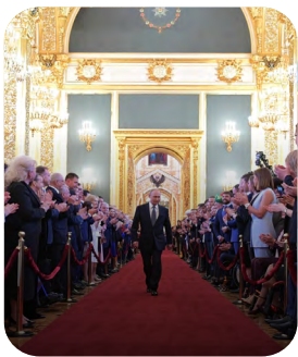
Figure 1 • The Process of Degenerate Autocracy