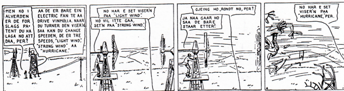
270. Formeget og forlidet skjæmmer ud Too Much and Too Little Are Equally Bad / May 6, 1927

1. "But what in the world kind of patent have you made now, Per?" "Oh, it's just an electric fan for driving the windmill. When you turn that pointer you can change the speed. There