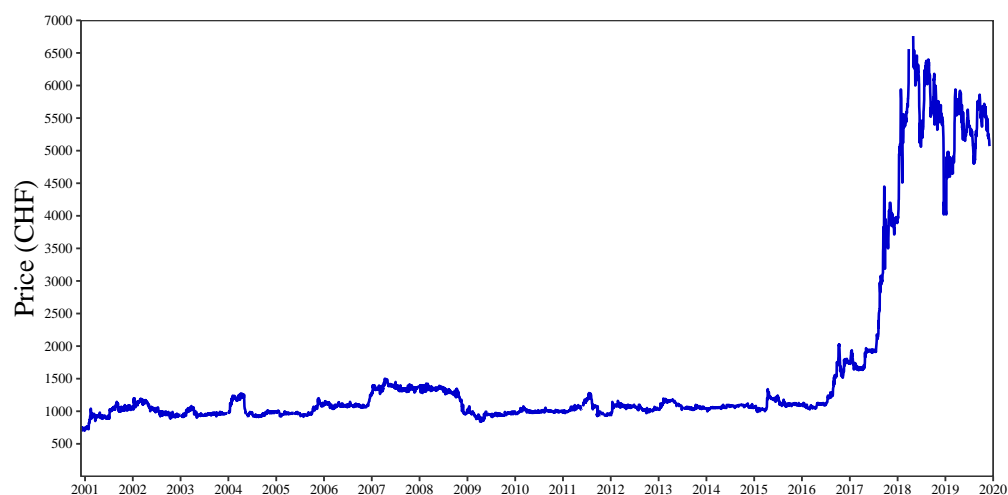
Figure 2: Swiss National Bank daily share price

These new economic conditions led to the nationalization of many central banks, such as the Bank of England in 1946 and the Bank of Spain in 1962, regardless of the political inclination of governments (left-leaning in the U.K. in 1946, right-wing authoritarian in Spain in 1962). But, even today, one can trade shares of many central banks on stock exchanges, including the Swiss National Bank (see Figure 2 for the daily price of this stock since 2001) and the Bank of Japan. Although these shares come with severe voting rights limitations, their active trading is proof that central banks used to be engaged in a very different set of activities from the pure conducting of conventional monetary policy.